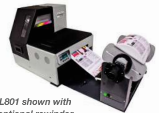
L801 shown with optional rewriter